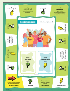
Skill Seekers Game Board