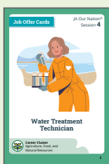
Job Offer Card