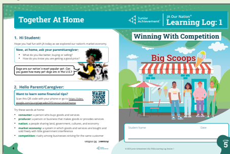
Together at Home