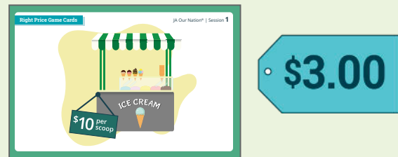
Right Price Scenario Cards and Price Tags